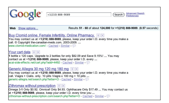
Figure 4: Searching for GlavMed's support number reveals over 120,000 online pharmacy sites.

area is exactly what powers the 'Canadian Pharmacy' sites advertised in spam.