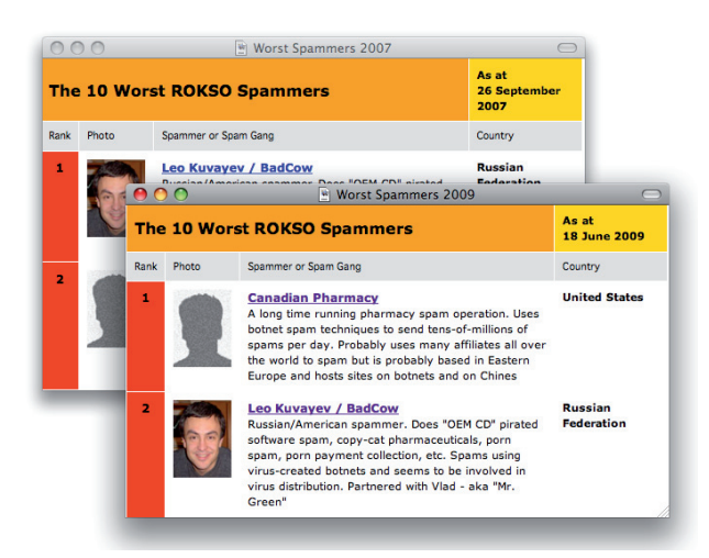
Figure 1: The 'Canadian Pharmacy' group now holds the number one position in the Spamhaus Top 10 spammers list.

spammer Leo Kuvayev, is now taken by the ambiguous 'Canadian Pharmacy' group.