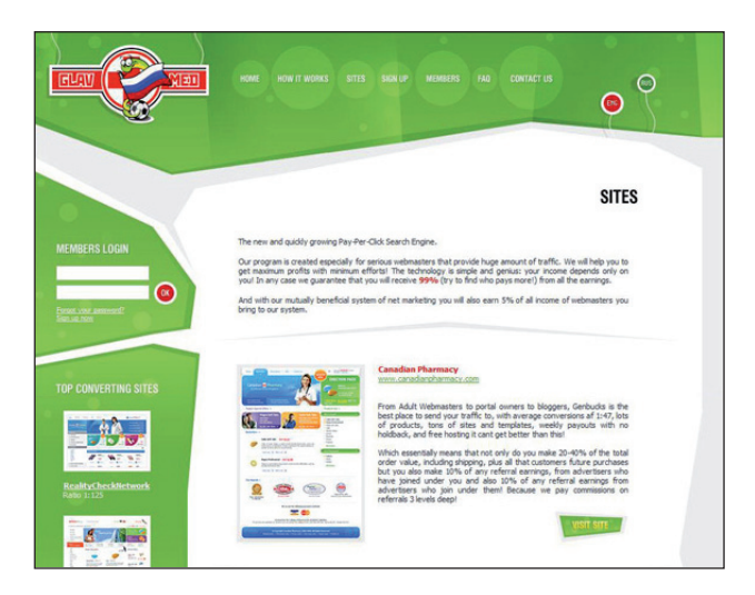
Figure 3: GlavMed.

This partnerka is open to the public but requires an invitation from another network member. Its main brand is the notorious 'Canadian Pharmacy', which is all too familiar to everyone through massive email spam campaigns that seem never to end. This spam is tied to a sister entity of GlavMed, called SpamIt (spamit.com), which is a closed private network of email spam affiliates that has proven hard to infiltrate.